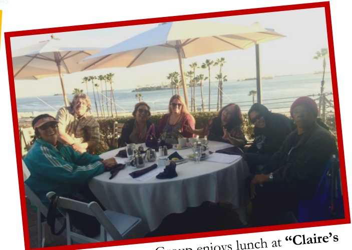
DRC's Coed Support Group enjoys lunch at "Claire's at the Museum," on a field trip to the Long Beach Museum of Art. 2/15/2018